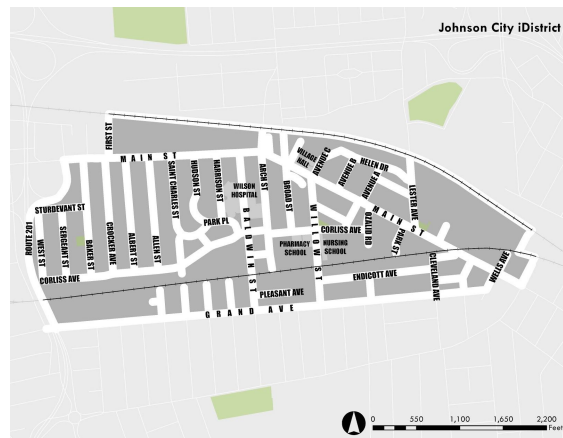
Johnson City iDistrict